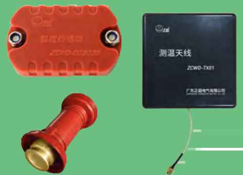
Temperature monitoring module

With the latest-generation of passive RFID wireless technology, the module is highly reliable and accurate. It is also small in size, easy to install, adaptable to various applications.